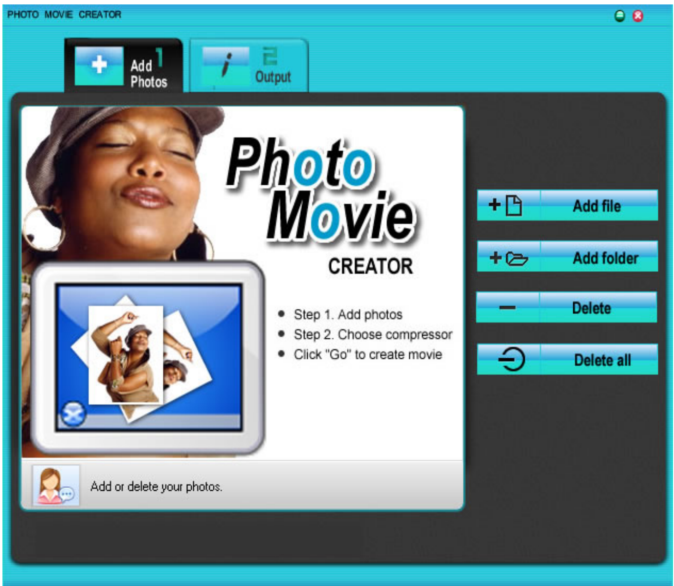
Photo Movie Creator can make wonderful slide show of your stacked digital photos in an easy way. What you need to do is just choose photos, choose background music then click go.

Photo Movie Creator makes a great innovation in displaying photos. It gives photos life, it makes photos lively. It is such an inexpensive and easy to use software to create your digital photos into dramatic movie.